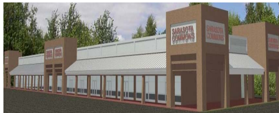
Sarasota Commons New Addition – Artist's Rendering