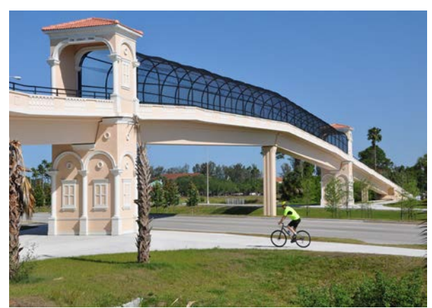
LEGACY TRAIL BRIDGE

The Legacy Trail Bridge was completed and the recreational trail connects with the Shopping Center. It is great to see the steady stream of bicyclists and walkers stopping at the property.