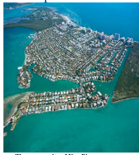
The community of Key Biscayne Flanked by Crandon Park to the North and Cape Florida Park to the South