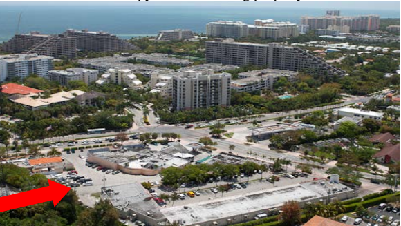
KEY BISCAYNE ENTRY BLOCK

which will also become a part of the holdings of Key Biscayne Gateway Partners, Ltd. We are also in negotiations with high profile National tenants to occupy this outstanding property.