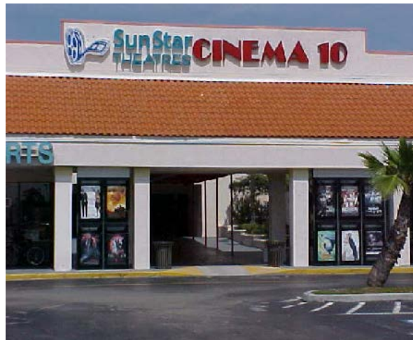
SunStar Cinema 10 at Sarasota Crossings

We plan to make periodic announcements to our partners throughout the year as the deal unfolds.